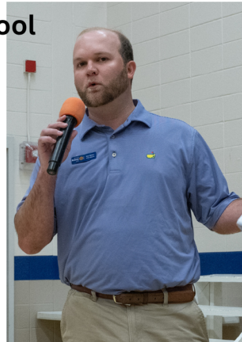
Comedy for a Cause