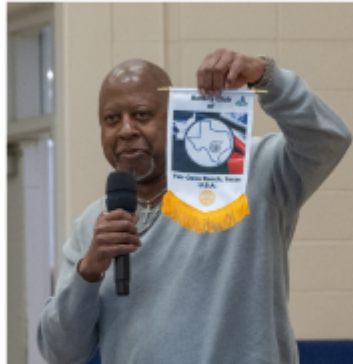
Go New Members!!!