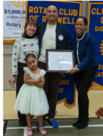
Frederick Levy Award for Hours of Service